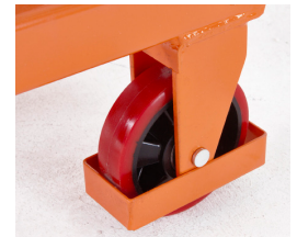
Swivel castors close Up