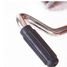
Manually operated via pump action foot pedal