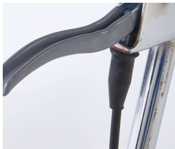
Slow release handle